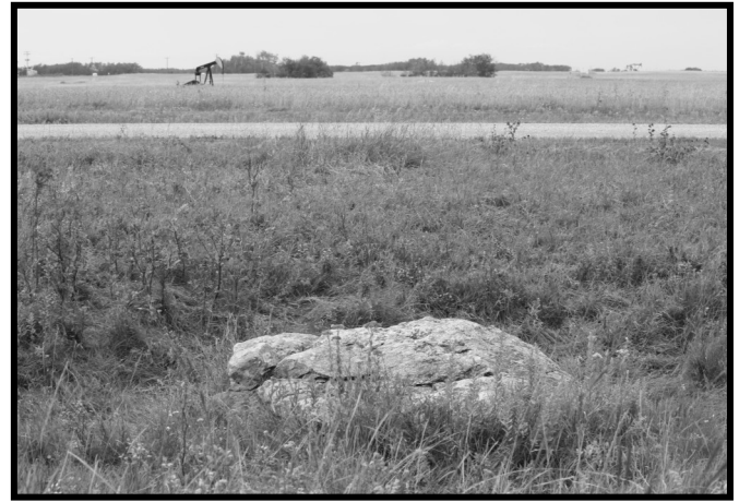
▲ A rubbing stone sits in an unploughed prairie pasture south of Pierson, Manitoba. It shares the landscape with nearby oil derricks.

Rubbing stones are a tangible reminder of the bison; an animal who once reigned supreme on the prairies. These boulders are also a reminder of how the landscape has been sculpted by human activities. When bison relieved their discomforts on such stones they were surrounded by nothing but open prairie. Today the stones sit in cattle pastures, where they are no doubt used in the same way as by the ancient bison. The difference is that today they sit within fences, beside roadways and beneath power lines.